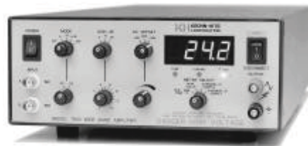
Model 7600M ("M" is the Meter Option Package)