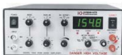
Model 7602M ("M" is the Meter Option Package)