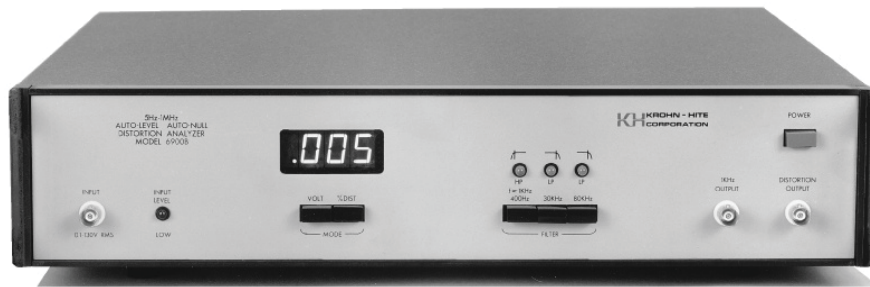
Figure 1.1 Model 6900B