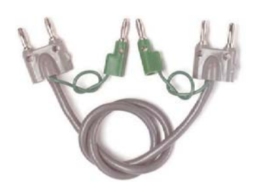
CAB-018: Cable, Multi-stacking Double Banana plug.