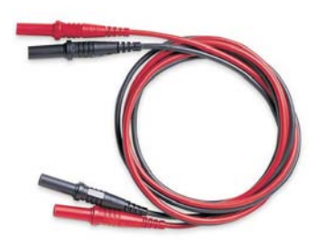
CAB-024: Cable Set, Low Thermal EMF Spade Lug