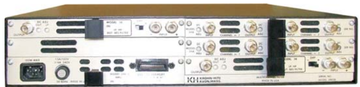
Model 3905C Rear Panel View

Specifications subject to change without notice.